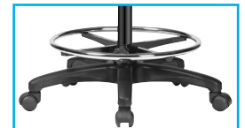
Optional drafting kit